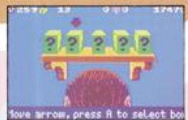
Move arrow, press R to select box

In the Guess room, an arrow appears on one of the five cans. Push a button to shuffle the cans. If Louie selects the can with the arrow in it, he receives a valuable prize.